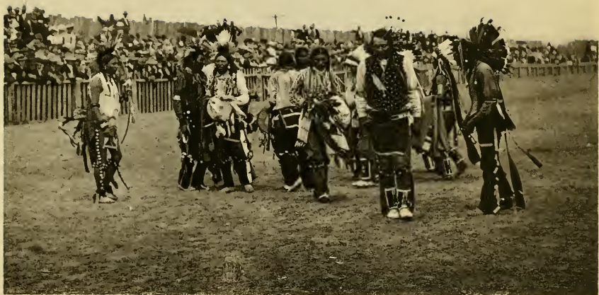
INDIAN WAR DANCE.